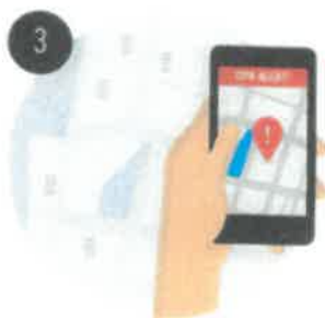
3 Signal received by nearby PulsePoint users.