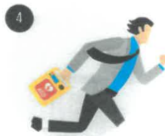
4 Users rush to help the victim before professional help arrives.