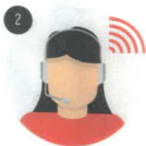
2 911 system sends PulsePoint alert.