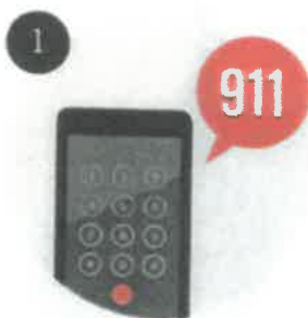
1 SCA victim in need.

PulsePoint alerts you to nearby people in need. For every minute that passes before help arrives, SCA survival decreases by 7%-10% . It's like an amber alert for SCA victims.